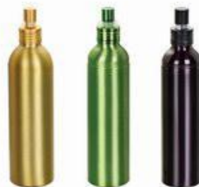
B-1 20/410 24/410